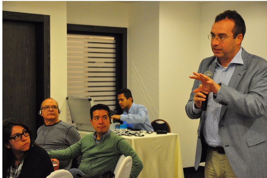
International Training on Open and Collaborative Platforms for Responsible Land Governance at Habitat III