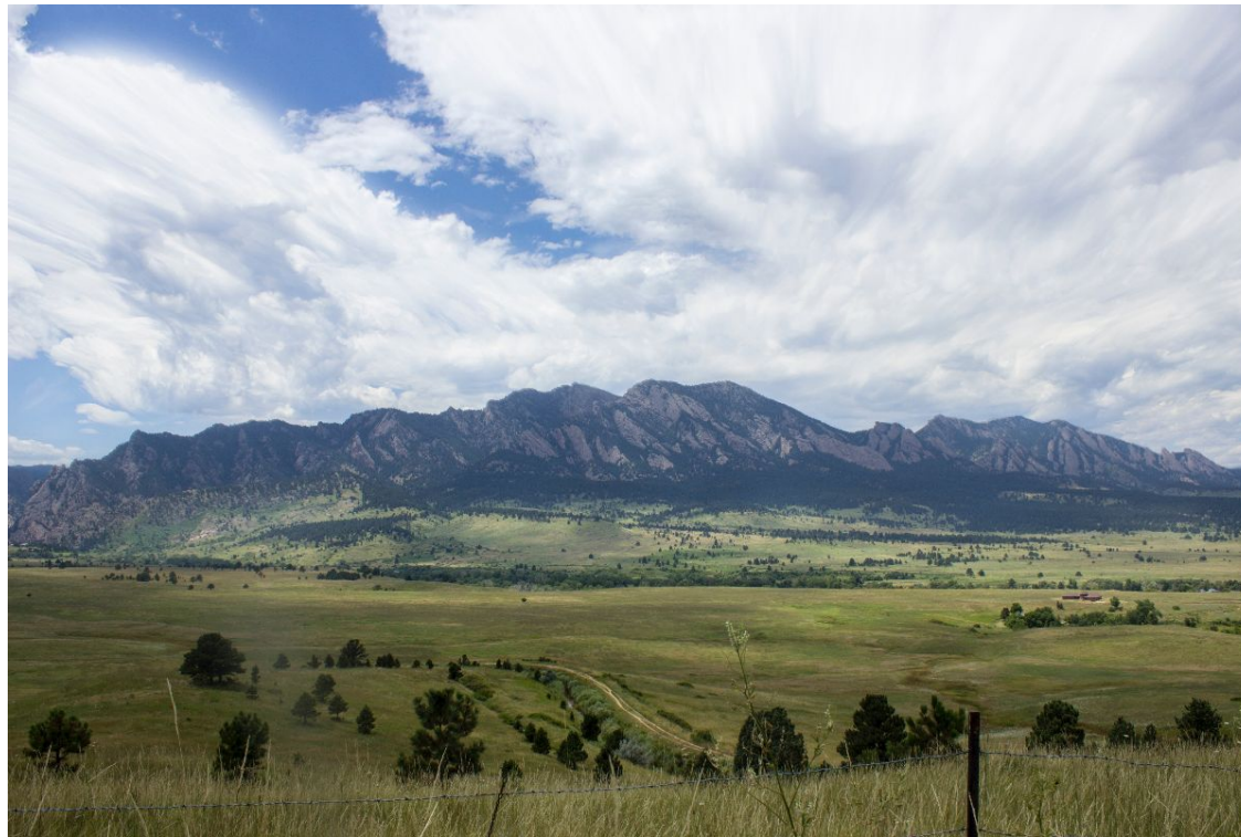
The Land Portal Launches Thematic

From May 8-10, 2019, we conducted a workshop on Catalyzing East Africa's Data Ecosystem . Organized in collaboration with colleagues from a variety of organizations, the overall goal of the workshop was to uncover the land data and information ecosystem (including gaps in existence, accessibility or abilities to re-use data) in East Africa and contribute to fostering a regional policy dialogue on access to data. We've also put together a community of practice to facilitate continued engagement on this front. Please reach out to us if you want to join this community and contribute to strengthen the land data ecosystem in the region!