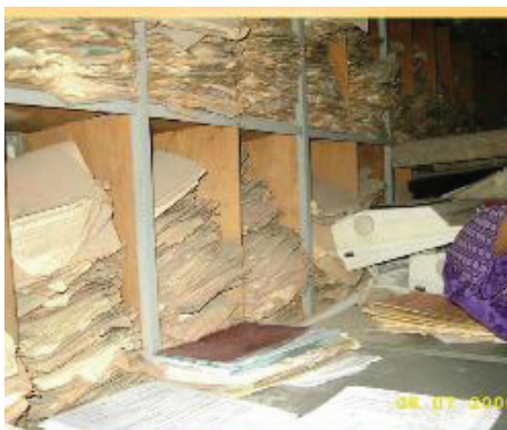
A typical analogue land registry

The question occasionally arises whether Nigerian states should continue to pursue a policy of land expropriation and development in the face of increasing conflict with current landholders and diminishing rationales for a state land program. When the Land Law was adopted, one of its main objectives was to exercise control over land allocation and use in such a way as to prevent excessive speculation and accumulation of landed wealth in a few hands, and to assure access to some land for a large part of the population. From the evidence presented above, it seems fair to suggest that these objectives have in fact not been achieved. Speculation is