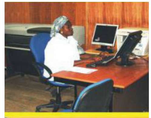
The new system and set up