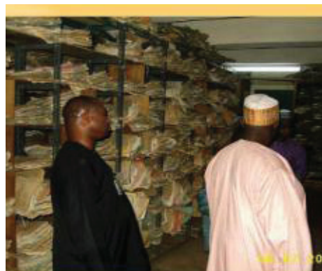
An organised analogue registry