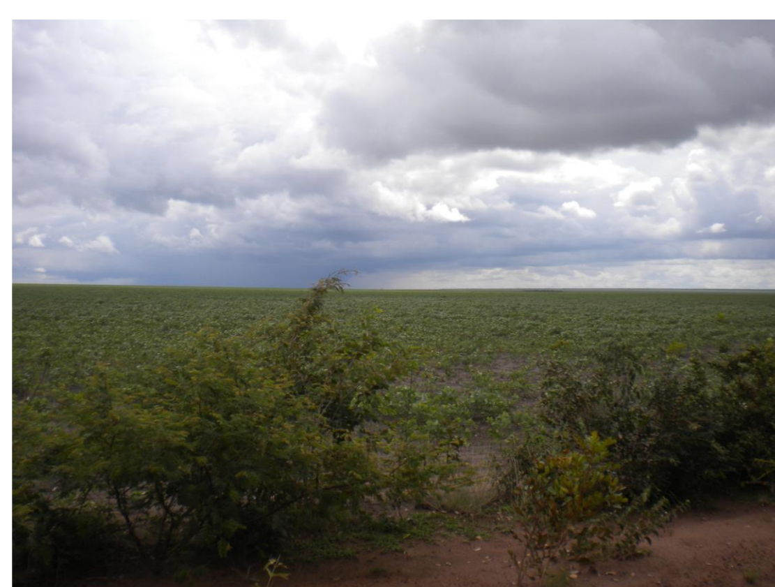
Land Prices Piauí - Cerrado - R$/ha from 2015 IGP/DI (FNP)