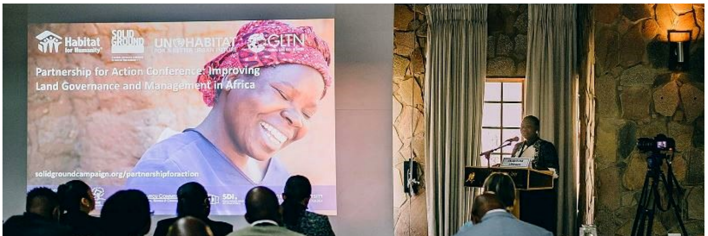
Hon. Amongin delivers her keynote address on August 15, 2017

The Hon. Jacqueline Amongin (Chair, Pan African Parliament Committee on Rural Economy, Agriculture, Environment and Natural Resources) affirmed the Pan African Parliament's commitment to partnering with civil society and grassroots organizations to champion land issues, increase food security and end hunger. She called for progressive laws promoting equity in land ownership, and affirmed the Pan African Parliament's commitment to increasing women's access to land. While there has been remarkable progress, Hon. Amongin acknowledged that many challenges still remain, including a lack of land data and the need for additional monitoring and evaluation tools.