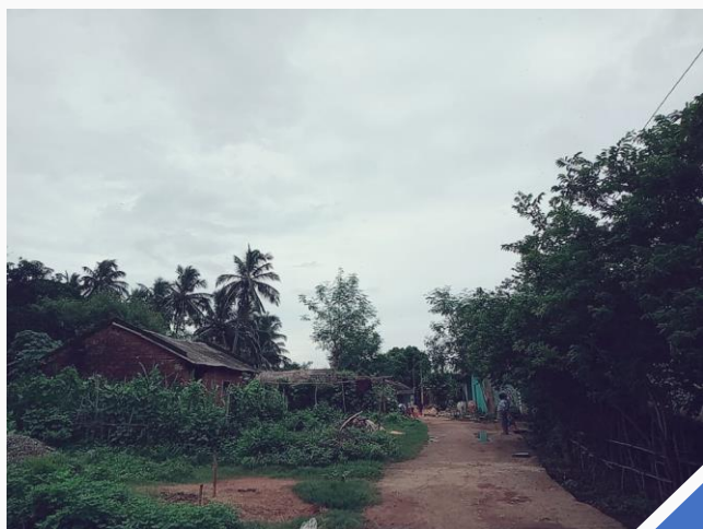
(L) The dense forests around Nathapur; (R) A portrait of Nathapur village

The Kondh Adivasi community of Nathapur village in Nayagarh district have been protecting the Tangi range forests for several decades. In fact, in the Ranpur block, women have had a long tradition going back to as many as 40 years of conserving forests. Despite this, their CFR rights have not been legally recognised. Nathapur villagers had realized the importance of forest and the role played by them in their lives early on, before the current climate crisis was apparent to many.