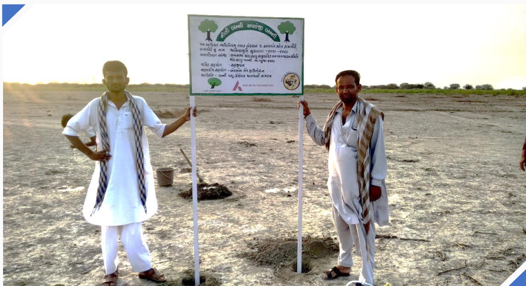
Maldhari pastoralists stand near a sign board proclaiming the Banni Grassland CFR area

The Maldhari communities are mainly dependent on indigenous livestock herding: the Kankrej cattle and Banni buffalo being the most common. Most families have 50-100 livestock, each village around 5000 and the entire area has over 1,00,000 livestock. While the pastoralist community could largely survive on their own milk production, some community members had food shortages. In