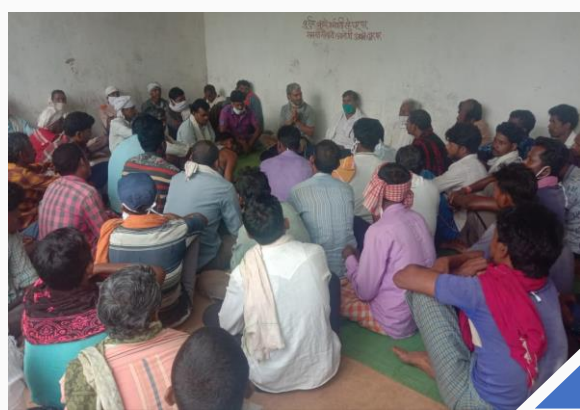
(L) Baiga women walking towards the forests; (R) A meeting of Gramdut Karyakram campaign and a Baiga Gram Sabha

Baiga Chakka, an area of dense forests, is primarily inhabited by the Baiga Particularly Vulnerable Tribal Group (PVTG). There are close to 70 villages in Umaria and Dindori districts that are part of this forested belt. Since 2008, the communities with the support of the Gramdut Karyakram and Jangal Adhyayan Mandal, two campaigns working on rights-based awareness, have been working towards recognition of forest rights. While in the initial years of the campaign, individual forest rights were recognised, it is since 2017 that the campaign has focused on the legal recognition of CFRs. Currently, 10 Gram Sabhas of Dindori block have their documents and evidence ready to claim CFR. These Gram Sabhas were ready to submit these to take forward the process of CFR when lockdown was announced.