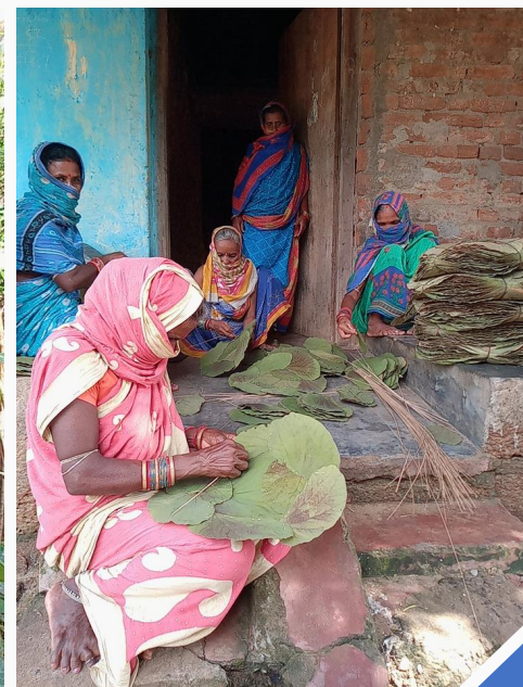
(L) A display of the Siali leaf plates prepared; (R) Women prepare Siali leaf plates