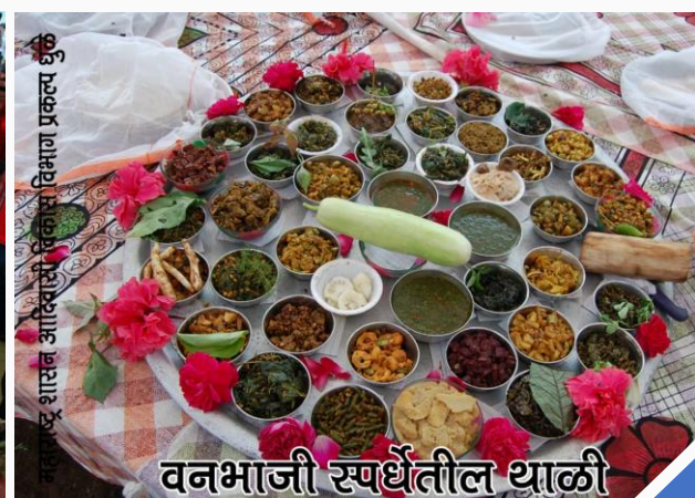
Villagers of Baripada are self-dependent on their own agriculture and forests

In 2017, the individual forest rights (IFRs) and CFRs of around 130 Kokni and Bhil Adivasi families, residents of Baripada village, Gram Panchayat Manjri, in the District of Dhule were legally recognised. Since the forests here are not very dense, villagers are agriculturalists and grow grains and vegetables throughout the year.