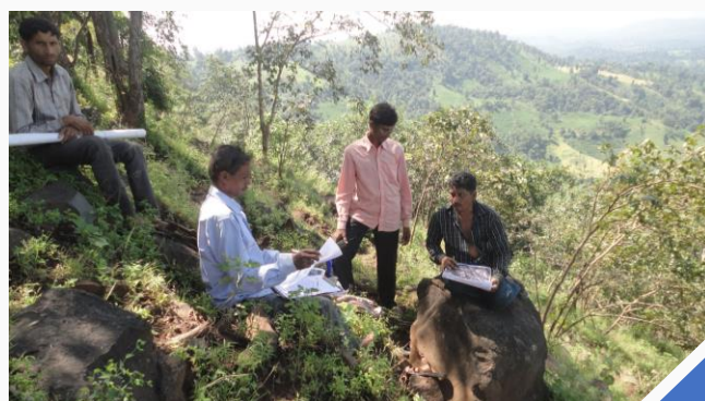
(L) Adivasi communities make their CFR management plans; (R) Mapping of Community Forest Resources

This story is about a cluster of 24 villages situated in the eastern-most part of Dediapada block in Narmada district. All these villages are exclusively Adivasi villages, predominantly inhabited by Vasava tribe, with some Tadvi tribe families in two villages. These villages are also a part of Shoolpaneshwar Sanctuary, which was declared in three phases- in 1982, 1987 and 1989- on 61,542.40 hectares of forest land, and has a total 104 villages, including 25 uninhabited villages.