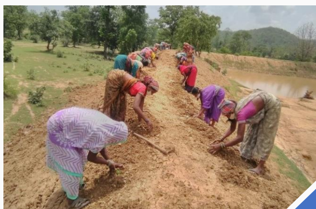
(L) Women clean the Mahua flower harvests; (R) The community carries out their regular CFR management work while maintaining safe distance