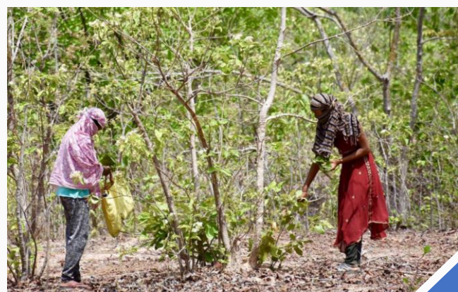
(L) Forest dwellers prepare bundles of Tendu leaf; (R) Women collect MFPs using masks and keeping safe distance

In Gondia district, 75% of the population is Adivasi, mainly Gond and Halba Adivasis. Over here, more than 250 villages have their CFR legally recognised, and in Deori block, 29 villages have formed a Federation to carry out their minor forest produce collection and sales. The Federation acts as an elected body that supports and assists the Gram Sabhas. It is governed by two representatives (a president and a secretary), from each of the 29 villages. Each year, the Federation ensures that collectors-the Adivasis and forest dwellers- are paid for all 11 days of their work during the season, unlike the Forest Department which would only buy and pay Tendu collectors for 2-3 days of their labour. Also, while the Forest Department, through its traders, pays collectors only INR 220 per day and seasonal bonuses are as low as INR 25, the Federation pays INR 300 per day and a seasonal bonus of INR 200.