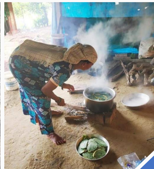
(L) Communities conserve and care for their forests; (R) Preparing a dish using diverse forest foods