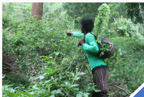
(L) Collecting Amla and other MFPs; (R) Soliga communities battle Lantana creepers, that grew alongside the teak planted by the Forest Department in earlier decades

The Soliga community, who live in and around the Biligiri Rangaswamy Temple (BRT) Tiger Reserve forest area, have a symbiotic relationship with nature. Over here, in Chamarajanagar district, CFR of 25 Gram Sabhas was recognised in 2011, and later 10 more were recognised in BRT Tiger reserve. At present, out of 61 Podus or settlements, 42 Podus of 35 Grama sabhas have their CFR legally recognised while the claims of 10 Podus are at the Sub divisional level and 9 Podus claims are at the Grama Sabha level.