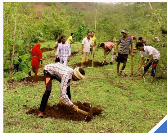
(L) Communities are employed and work for their own forest management; (R) Community planted local trees on CFR areas

Nandurbar district has the second highest acreage of CFR recognition in Maharashtra, where in April 2018, communities had titles over 2,16,723.10 acres of land . The forests have plenty of Bhutya (Gum tree/ Sterculia urens ), Mahua flowers ( Madhuca longifolia ), Cuddapah Almond (Char tree/ Buchanania lanzan ) trees and as part of CFR Management plans, the CFRMCs are guiding to plant more trees that help to support livelihood of forest dwellers.