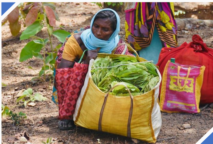
Forest Dwelling woman with the Tendu leaf harvest of the day

This year during lockdown, the Federation of 29 villages earned INR 2.5 crores by selling Tendupatta, while managing everything themselves and taking precautions against the spread of COVID19. Furthermore, the Federation had used the substantial profits from sales in 2017 of Tendupatta to rent machinery to dig lakes in the Gram Sabhas for rainwater harvesting. The groundwater was recharged in these areas and therefore villagers could also focus on paddy cultivation. When members of the support NGO Vidarbha Nature Conservation Society (VNCS) went to the community to provide relief kits, the community felt self-sufficient and therefore refused to accept these kits.