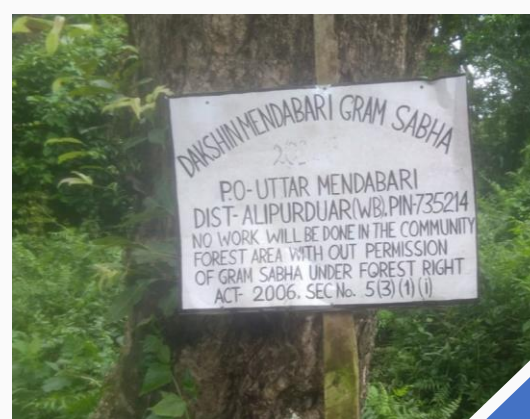
(L) A board at the entrance of Kodal Basti, proclaims Community Forest Rights!; (R) Dakshin Mendabari self-proclaims Community Forest Rights

While CFRs are still officially unrecognised by the government of West Bengal, the Adivasi communities- Rawa, Santhal, Oraon, Mech and Koch and other forest dwelling Van Taungya communities, living in and around the Jaldapara National Park and Buxa Tiger Reserve in Alipurduar district in West Bengal, have been accessing and conserving the forests for several years.