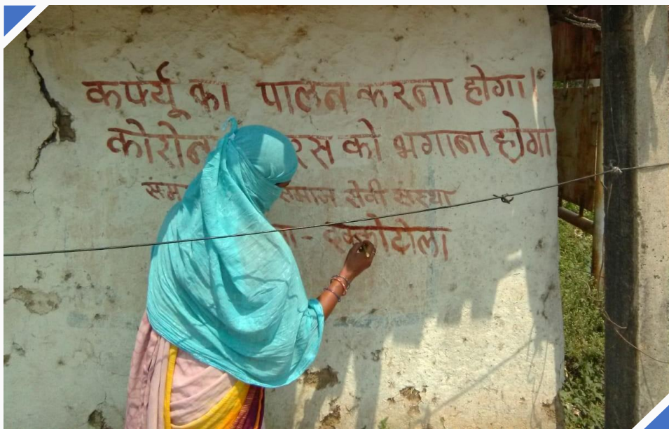
An Adivasi woman painting the walls with awareness slogans about coronavirus and social distancing

In both forest produce collection and food distribution it was important to safeguard communities from the possibility of infection. The Gram Sabhas decided to prohibit food distribution at the Public Distribution Centres in order to avoid overcrowding. Instead they decided to distribute food to each and every household doorstep, via the Gram Panchayat, after keeping the food in the sun for 48 hours. Prior to food distribution, in order to spread awareness about COVID19, the Gram Panchayats were instructed to paint slogans with health information on walls in public locations and to use a loudspeaker to share information.