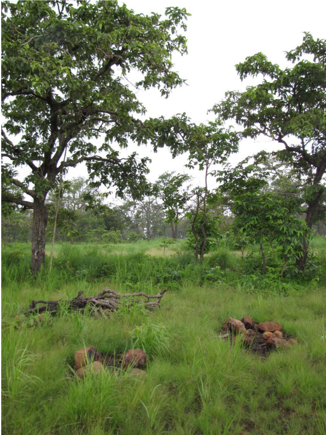
View of the Proposed Mining Lease area