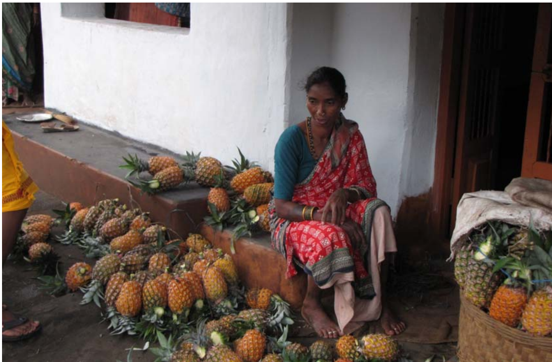
Dalit men and women in Khambesi village, district Rayagada, preparing pineapples grown by the Dongaria Kondh residents of the villages for sale in the local market