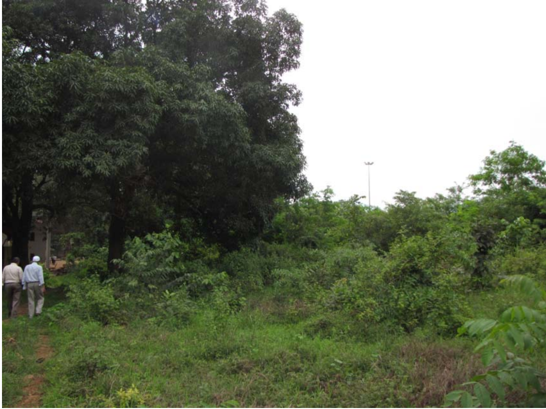
Village forest ( gram jogya jangal ) illegally taken over and enclosed by the Vedanta refinery