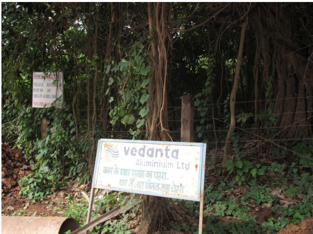
Village forest ( gram jogya jangal ) illegally taken over and enclosed by the Vedanta refinery