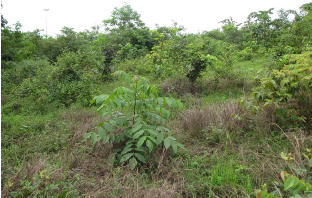
Village forest ( gram jogya jangal ) illegally taken over and enclosed by the Vedanta refinery