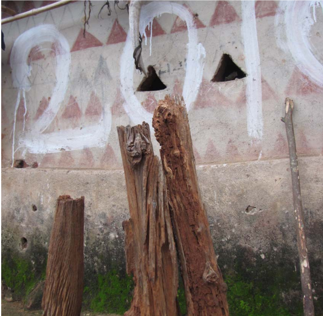
Shrine and sacrificial altar to Niyam Raja and Dharini in Khambesi village, district Rayagada (note the triangular motif on the prayer-house wall, signifying the Niyamgiri hills)