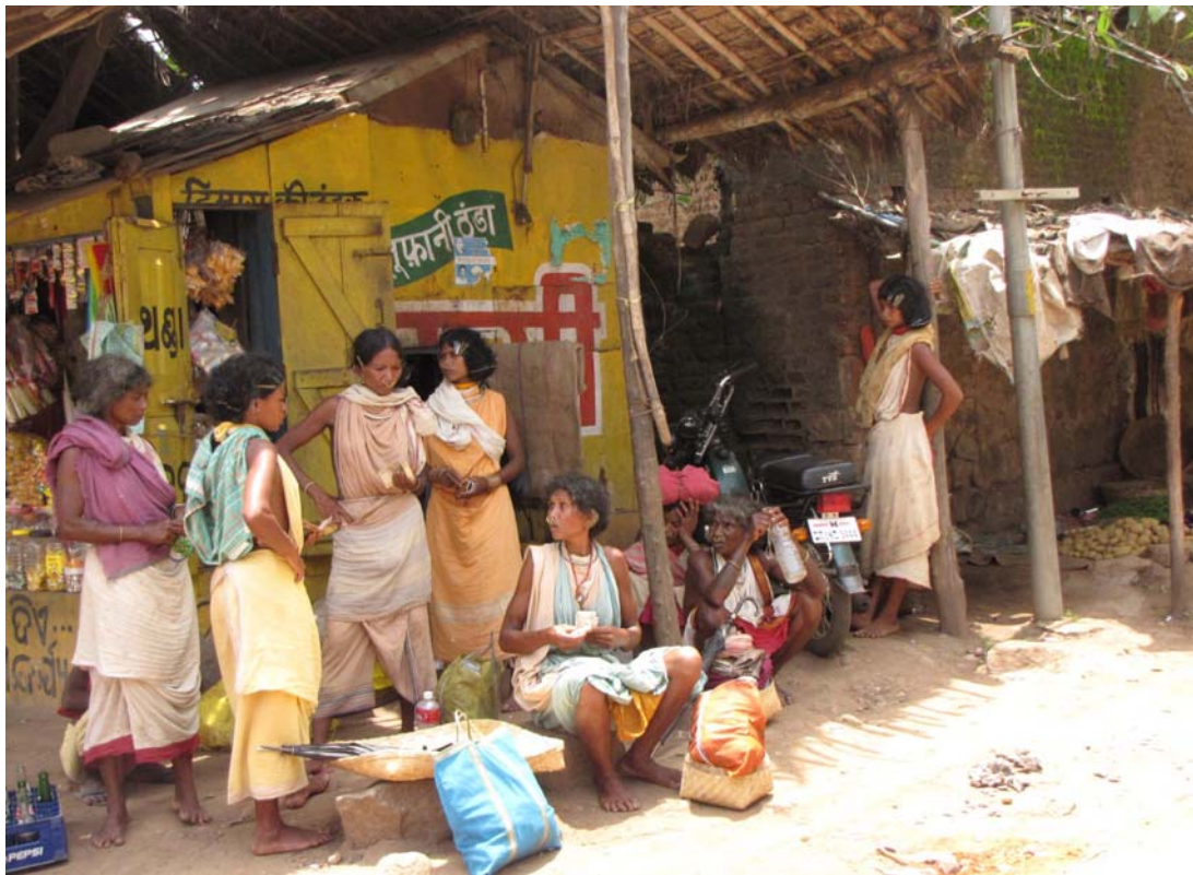
Dongaria Kondh women at the market in Muniguda, Rayagada district

All Dongaria Kondh that the Committee spoke to expressed their strong attachment to the Niyamgiri hills, their stewardship of the land, and the legitimacy of their rights