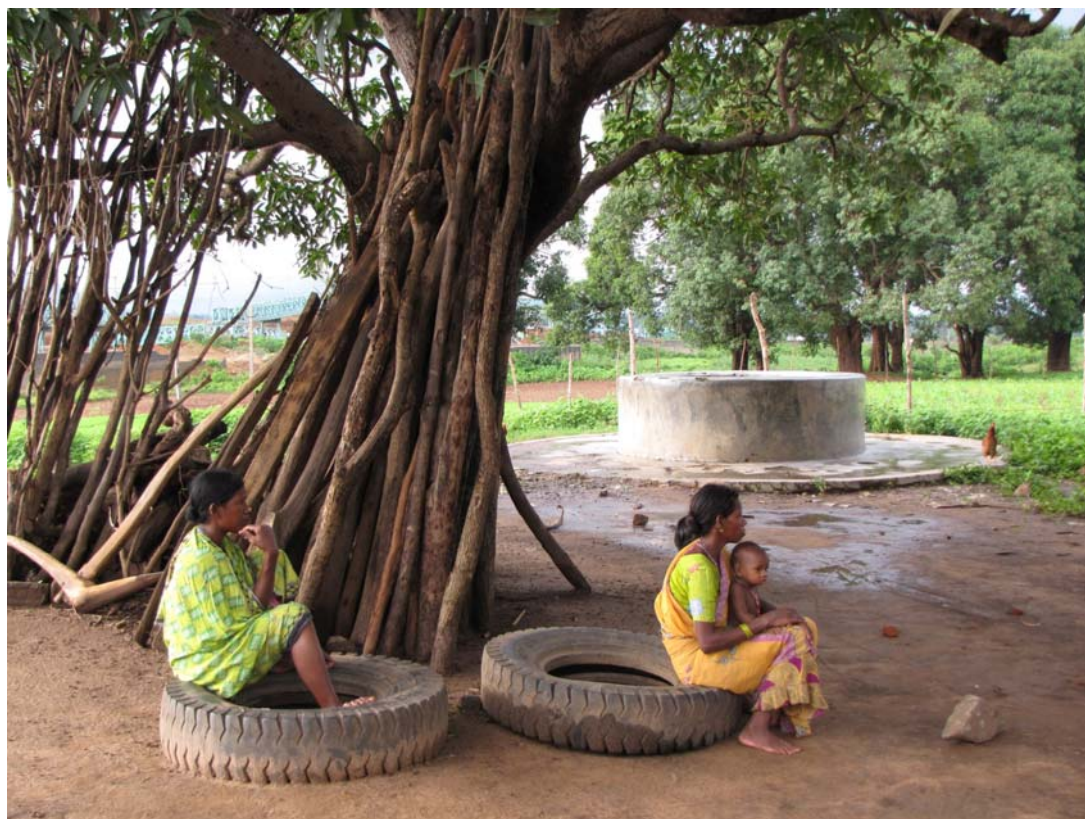
Bandhaguda village, district Kalahandi, adjoining the refinery: dispossessed yet not ‘displaced’