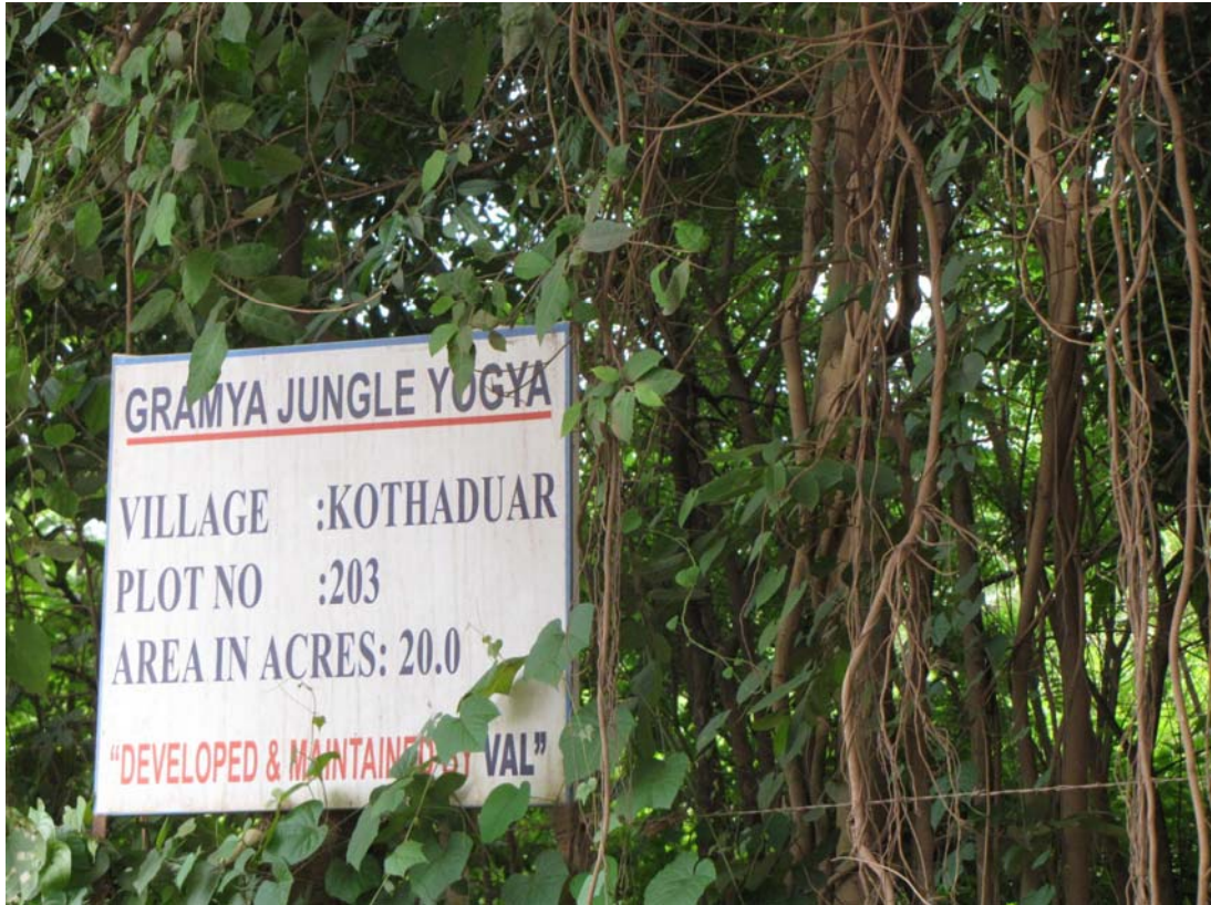
Village forest ( gram jogya jangal ) illegally taken over and enclosed by the Vedanta refinery