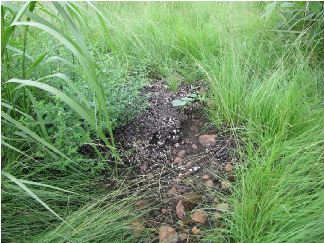
Decomposing scat showing the presence of wildlife in the Proposed Mining Lease area