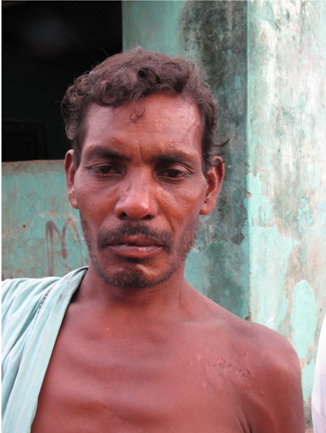
Men with diseases in Bandhaguda village, district Kalahandi (TB and asthma, skin infections) that they attributed to the dust and water pollution from the refinery