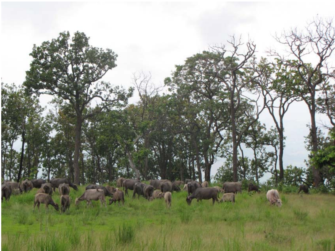
Buffaloes grazing in the Proposed Mining Lease area. Buffalo rearing among the Kondh is not for milk but for ritual sacrifice and meat.