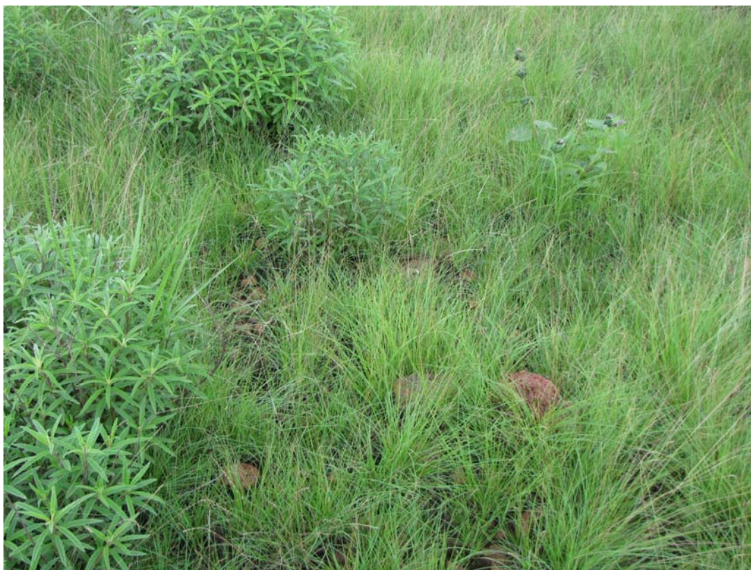
Grasses and herbs on the plateau, the Proposed Mining Lease area

The grasses are breeding and fawning ground for Four Horned Antelope ( Tetracerus quadricornis ), Barking Deer ( Muntiacus muntjac ), Indian Hare ( Lepus nigricollis ) as well as Spotted Deer ( Axis axis ). The wild life productivity of this habitat is particularly high because it provides the valuable “edge effect” to wild animals with open grasslands as feeding space and the neighbouring trees for shelter and escape.