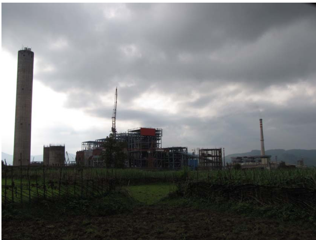
Vedanta Alumina factory showing illegal chimney and other construction