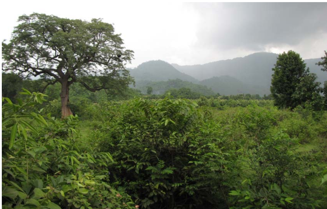
The Niyamgiri hills, Orissa

The PML site itself is largely grassland surrounded by Sal forests which is an edaphic climax 6 for this type of land. Under the Champion & Seth system of forest ecological classification this forest is classified as 3C. North Indian Tropical Moist deciduous Forests – C2e(i). Moist Peninsular High Level Sal . Sal is the predominant crop. Usual associates of Sal in these forests are Terminalia tomentosa , Terminalia chebula , Xylia xylocarpa , Cedrella toona , Pterocarpus marsupium , Adina cardifolia , Syzizium cuminii , Grewia taelifolia , G. elastic , Aegle marmelos , Bauhinia retusa , Colebrookia oppositifolia , Butea monosperma , Careya arborea , Embelica officinalis .