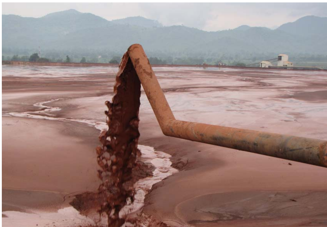
Red mud pond of the Vedanta Alumina refinery at Lanjigarh, Kalahandi district (responsible for dust pollution)

In a more detailed inspection two months later, however, the OSPCB found the water in the storm water drains inside the plant, which discharged to river Vamsadhara, had a pH value of 9.46. 63 It stated that this pH value was possibly due to alkali contamination linked to spillages from the plant process areas. It noted that the online monitoring system for pH had not yet been installed in all storm water drains.