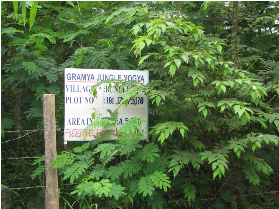
Village forest ( gram jogya jangal ) illegally taken over and enclosed by the Vedanta refinery

Almost all the villagers from Rengopali and Bandhaguda near the refinery on 19 July, 2010, reported severe discontent with the Vedanta refinery. Their specific allegation was that the refinery had taken over their village forest lands and denied access to them. They claimed that the factory has cornered and marginalized them with the knowledge of the district administration. The latter did not intervene to support them, and might have even supported the refinery's unfair action. The MP of Kalahandi, Shri Bhakta Charan Das, in a later meeting with the Committee stated that the company has illegally occupied forest lands belonging to tribal and Dalit villagers. He claimed that the clearances granted to the company by MoEF under the EPA are illegal, because these were granted on the basis of false information.