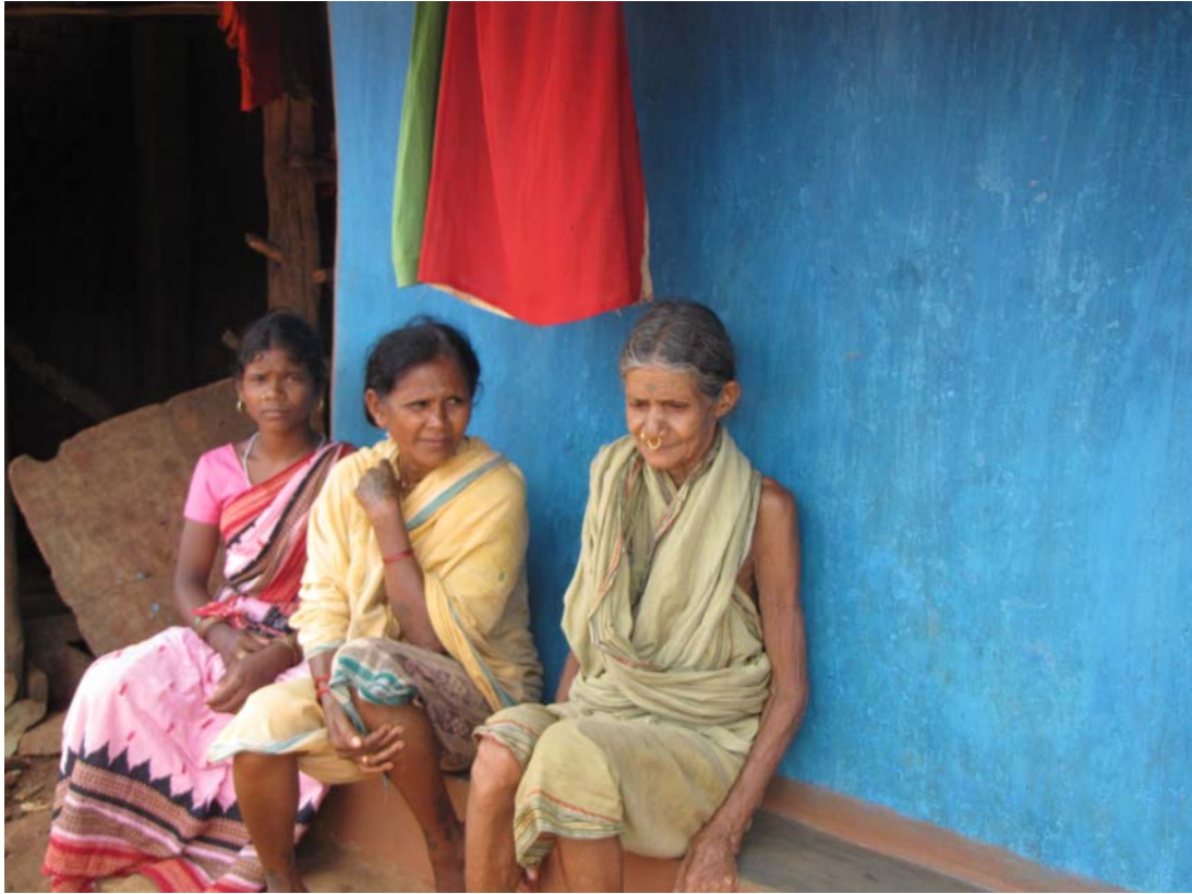
Kutia Kondh women in Kendubardi village, district Kalahandi