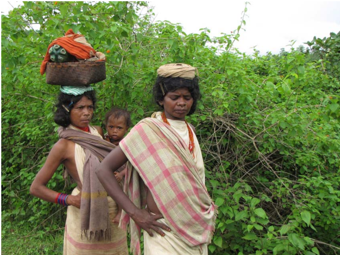
Dongaria Kondh women with mushrooms collected from the forest, near Parsali, district Rayagada