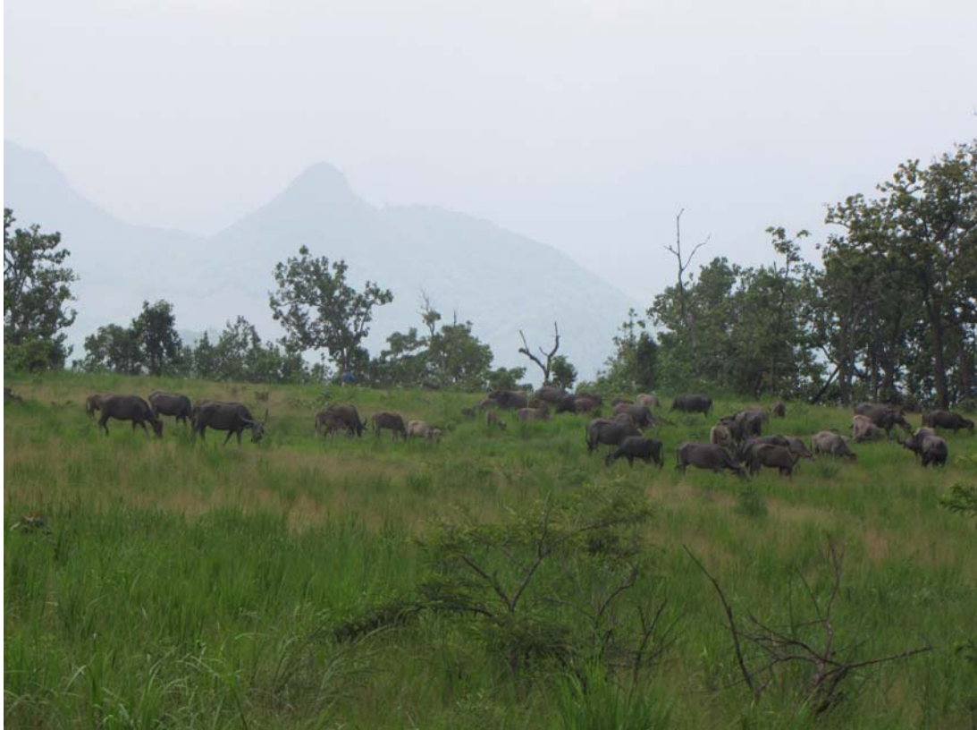
Buffaloes grazing in the Proposed Mining Lease area, showing Dongaria Kondh villagers' customary use of the forests on the plateau. Buffalo sacrifice is a central element of Dongaria Kondh religious practice