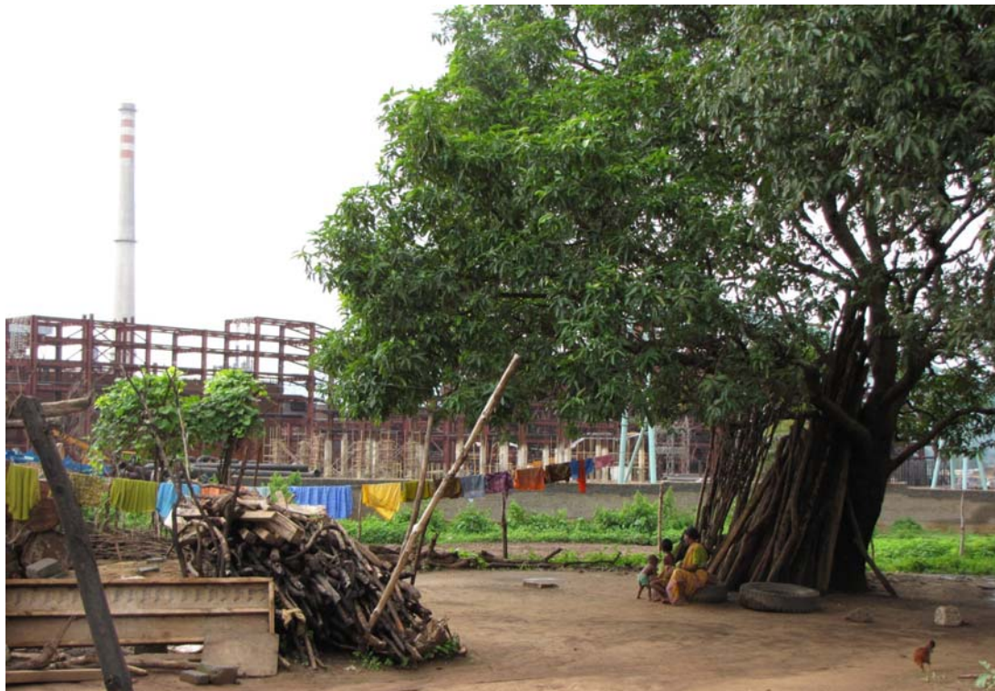
Bandhaguda village, district Kalahandi, adjoining the refinery: dispossessed yet not 'displaced'

In Rengopali with a total number of 96 households, twentyfour households each have one member who is casually employed outside the refinery. The income from this employment is low and unstable (averaging Rs 4,000 to 5,000 per month) and is not enough for regular sustenance. According to Lingaraj Majhi, a few household used their compensation money to buy land in nearby villages such as Patarguda. However, they were coerced into giving it up it by the villagers there. As a result, no one at present has any access to agricultural land. In Bandhaguda, Moti Majhi (a Kutia