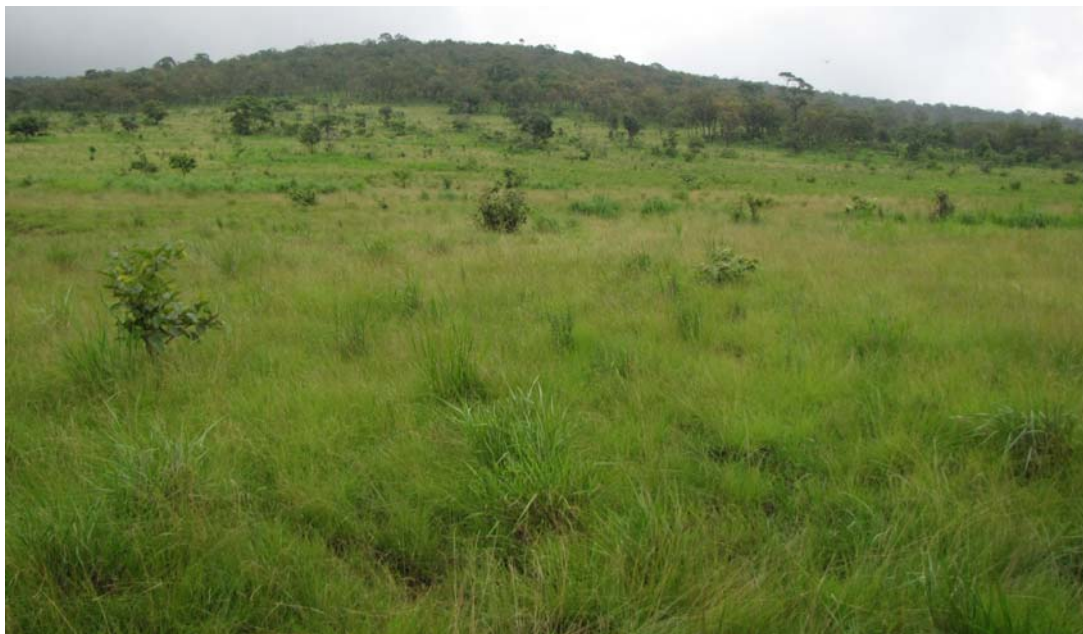
The Niyamgiri hills, Orissa: Mining Lease Area

laxa , Themeda arundinacea and Cymbopogon martini . This type of grassy meadow eco-system is usually found on lateritic zones on upper reaches at about 700 meters and above. The fact that this eco-system is mostly prevalent in Dongaria Kondh inhabited areas suggests that besides natural geological and climatic factors, human factors such as burning for grasses and collection of Minor Forest Produce (MFP) practiced over a long period by the hill tribe may have also been a determining factor. Fires are an annual feature leading to establishment of grasslands which leads to increased grazing both by wild herbivores and by cattle.