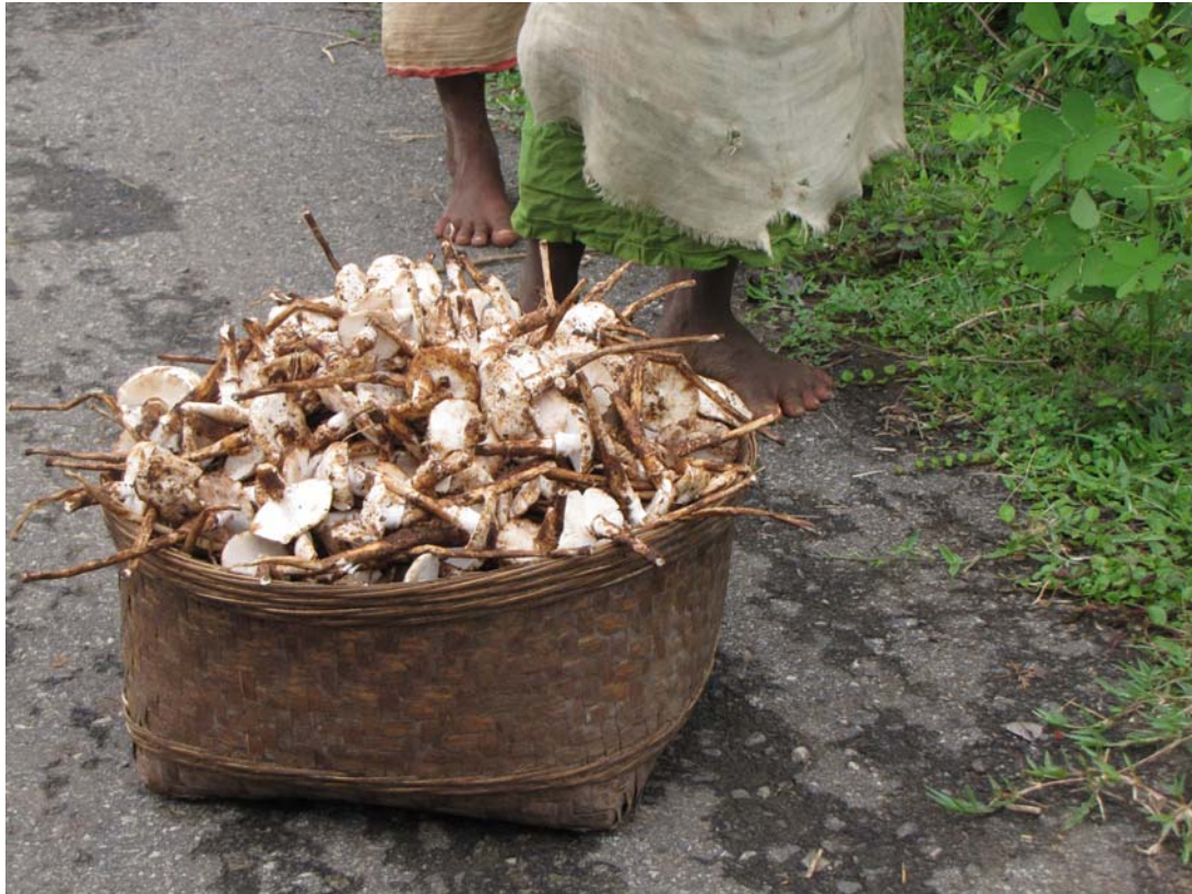
Dongaria Kondh women with mushrooms collected from the forest, near Parsali, district Rayagada