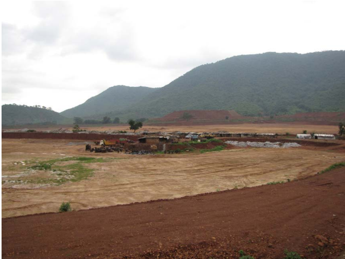
Red mud pond of the Vedanta Alumina refinery at Lanjigarh, Kalahandi district (responsible for dust pollution)

The OSPCB contacted Vedanta Alumina directing it to explain why the OSPCB's directions had not been complied with, stating that it did not consider that the company had comprehensively addressed these concerns in its response. 66 Vedanta Alumina sent a response to the OSPCB in July 2008, stating that all parapet walls in the process areas had been raised; parts of the process units were being lined with steel; the recirculation system for ash pond filtered water was ready; and the clean water pond had been repaired.