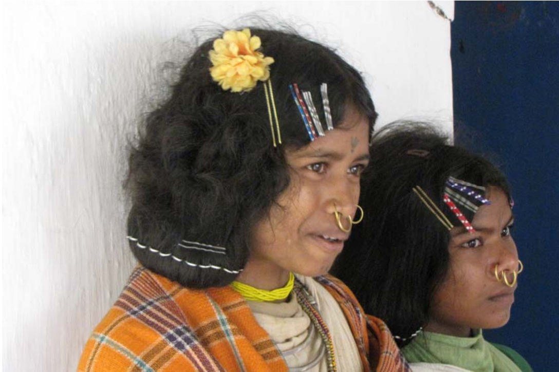
Dongria Kondh girls, Lakpadar village, district Rayagada