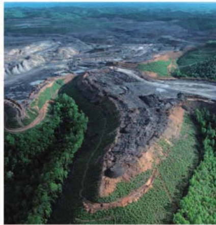
West Virginia's mountains contain valuable low-sulphur coal.

The EPA recommends that mining activity should not increase the electrical conductivity of stream water (a measure of its ionic concentration) beyond 500 microsiemens per centimetre ( \mu\text{S cm}^{-1} ). Yet a previous study 1 demonstrated significant changes in the size and composition of macro-invertebrate communities — such as mayflies and caddis flies — at lower conductivity levels. A second study 2 found that increases in the concentration of metals in stream water, and decreases in stream invertebrate biodiversity, were correlated with increased sulphate concentrations, an indicator of mining. But neither study established a direct link between mining and the environmental changes.