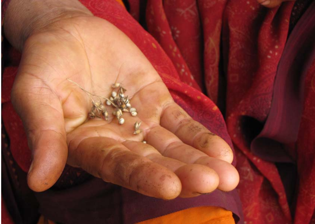
Cereals grown on forest fields by Kutia Kondh in Kendubardi village, district Kalahandi

worked for wages. 25 The Dongaria Kondh we met were proud of their economic independence and freedom from want. Over and over again, they attributed their well-being and contentment to the Niyamgiri hills and their bounty.