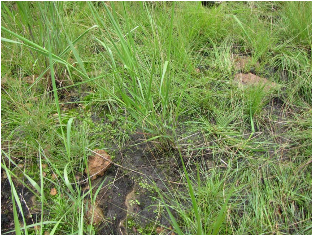
Soil composition, showing water retention and drainage, in the Proposed Mining Lease area

sanctioned proposals, and the state administration seems reluctant to do so.