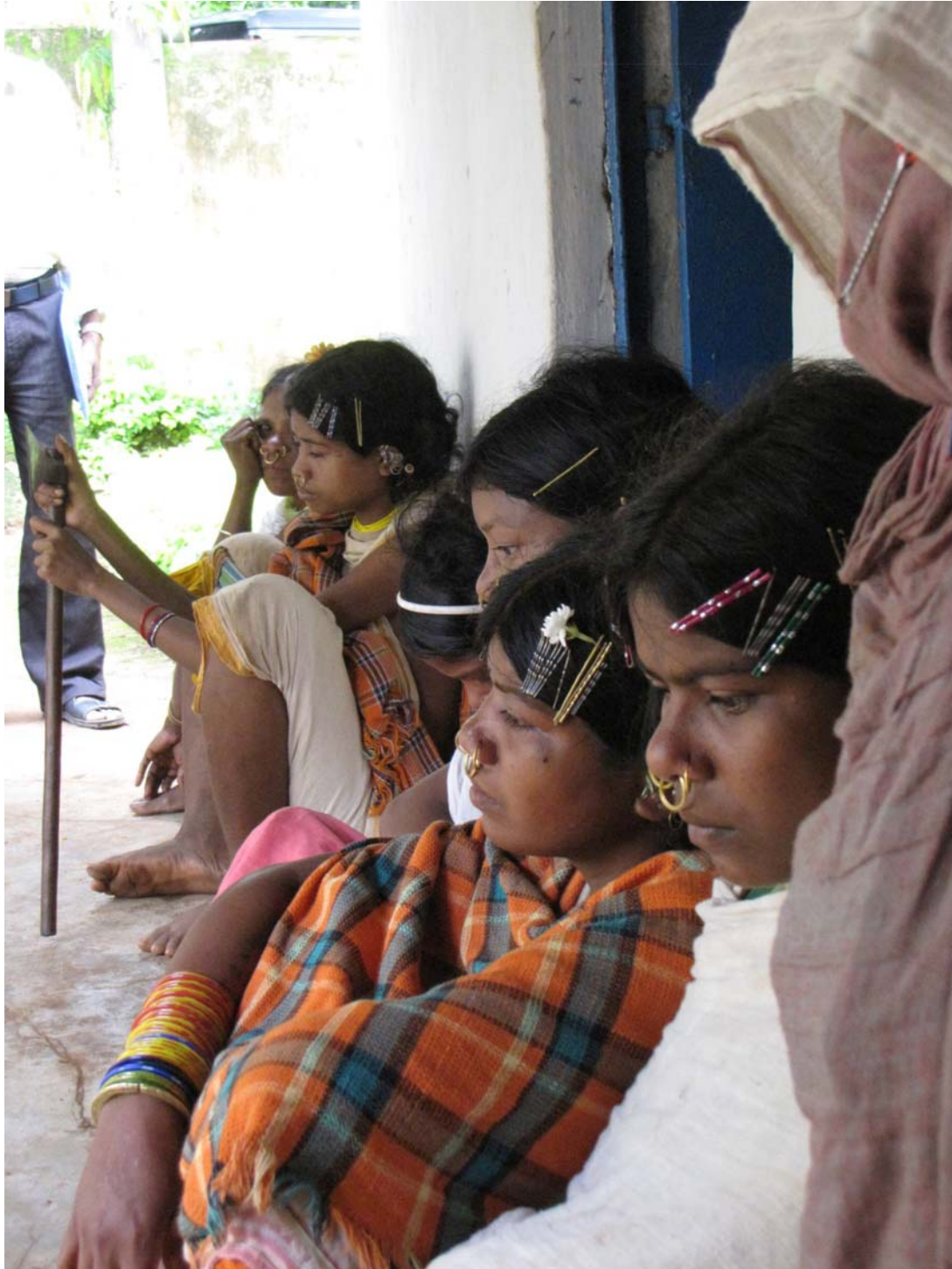
Dongaria Kondh girls, Lakpadar village, district Rayagada

forest for their livelihoods. Since the forest resource satisfy the bulk of their material needs, only four households out of 50 supplement their income with wage labour.