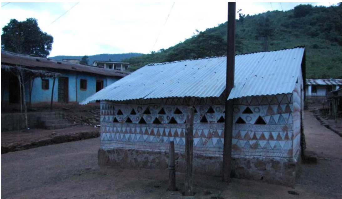
Dongaria Kondh prayer-house walls, showing the triangular motif signifying the Niyamgiri hills, in Kurli village, district Rayagada