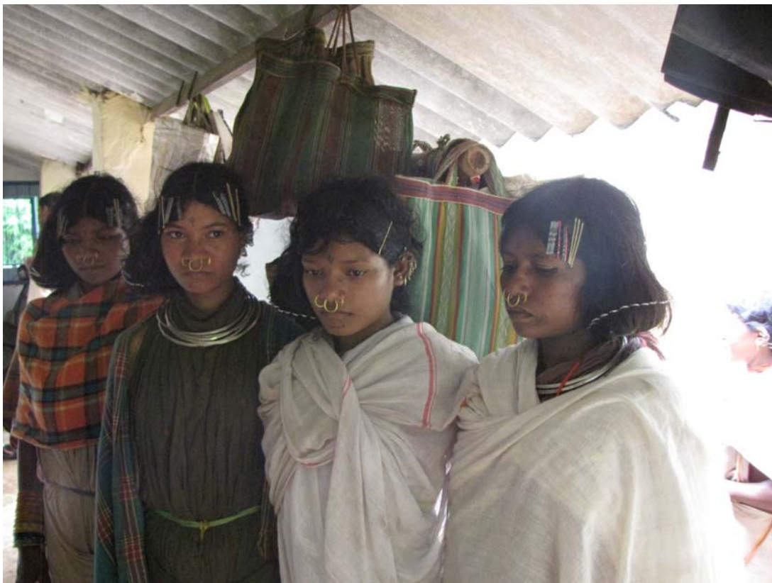
Dongaria Kondh girls, Lakpadar village, district Rayagada

While the Kutia Kondh inhabit the foothills, the Dongaria Kondh live in the upper reaches of the Niyamgiri hills which is their only habitat. 20 In the polytheistic animist worldview of the Kondh, the hilltops and their associated forests are regarded as supreme deities. The highest hill peak, which is under the proposed mining lease area, is the home of their most revered god, Niyam Raja, ‘the giver of law’. 21 They worship the mountains ( dongar from which the Dongaria Kondh derive their name) along with the earth ( dharini ). These male and female principles come together to grant the Kondh prosperity, fertility and health. As Narendra Majhi, a Kutia Kondh from Similibhata village, said, ‘We worship Niyam Raja and Dharini Penu. That is why we don’t fall ill’. Sikoka Lodo, a Dongaria Kondh from Lakpadar village said, ‘As long as the mountain is alive, we will not die’. Dongaria Kondh art and craft reflect the importance of the mountains to their community—their triangular shapes recur in the designs painted on the walls of the village shrine as well as in the colourful shawls that they wear.