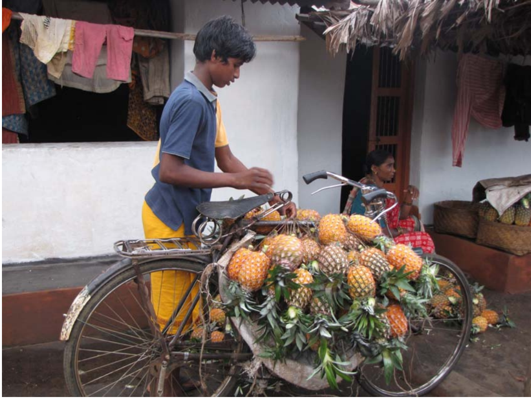
Dalit men and women in Khambesi village, district Rayagada, preparing pineapples grown by the Dongaria Kondh residents of the villages for sale in the local market